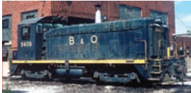
Prototype photo courtesy of James Mischke collection.