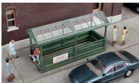
933-3762 Subway Entrance (2-Pk) $19.98