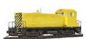
Preproduction Model Shown