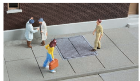
933-3763 Sidewalk Elevator (2-Pk) $14.98