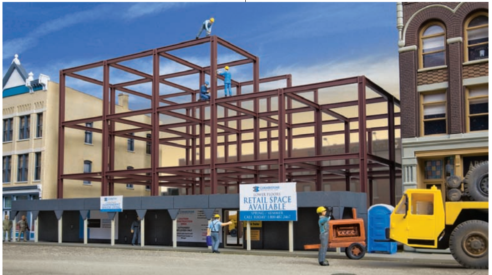
933-3761 Construction Site $29.98