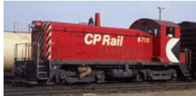
Prototype photo courtesy of Bruce Chapman.